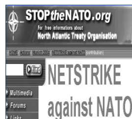
Figure 11-4 StoptheNATO.org's Netstrike Against NATO campaign.

Beyond temporary space system negation efforts, negation may also be undertaken through the application of force to degrade or actually destroy the ground or space segments of an adversary's space systems. Terrestrial satellite control and launch facilities are vulnerable to a wide range of military attacks that could degrade or completely destroy essential components of an actor's space systems or their access to space. Indeed, this approach is widely assessed to be the most cost effective and readily achievable space negation option for most actors. However, attacks against control stations would risk the creation of collateral space debris because satellites without effective ground stations would not receive orbit control or space debris mitigation commands.